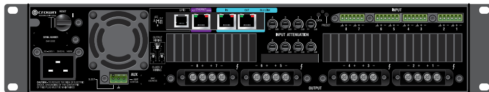
8|600N model shown