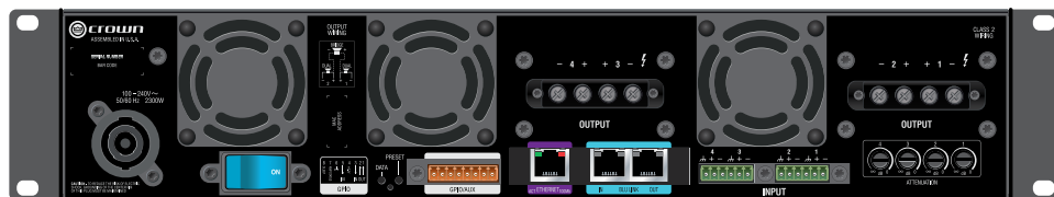
4|2400N model shown