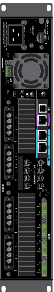
8|600 N model shown